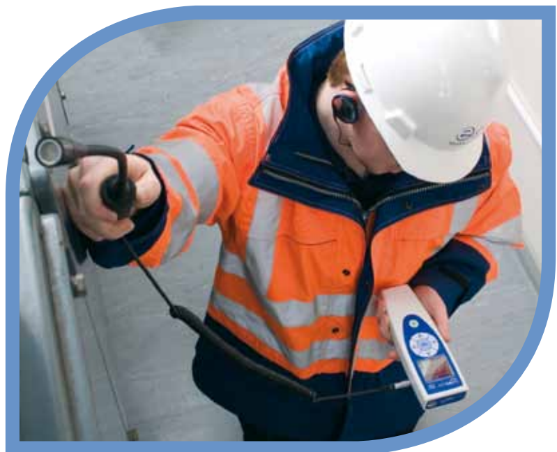
Optional external microphone extends reach.